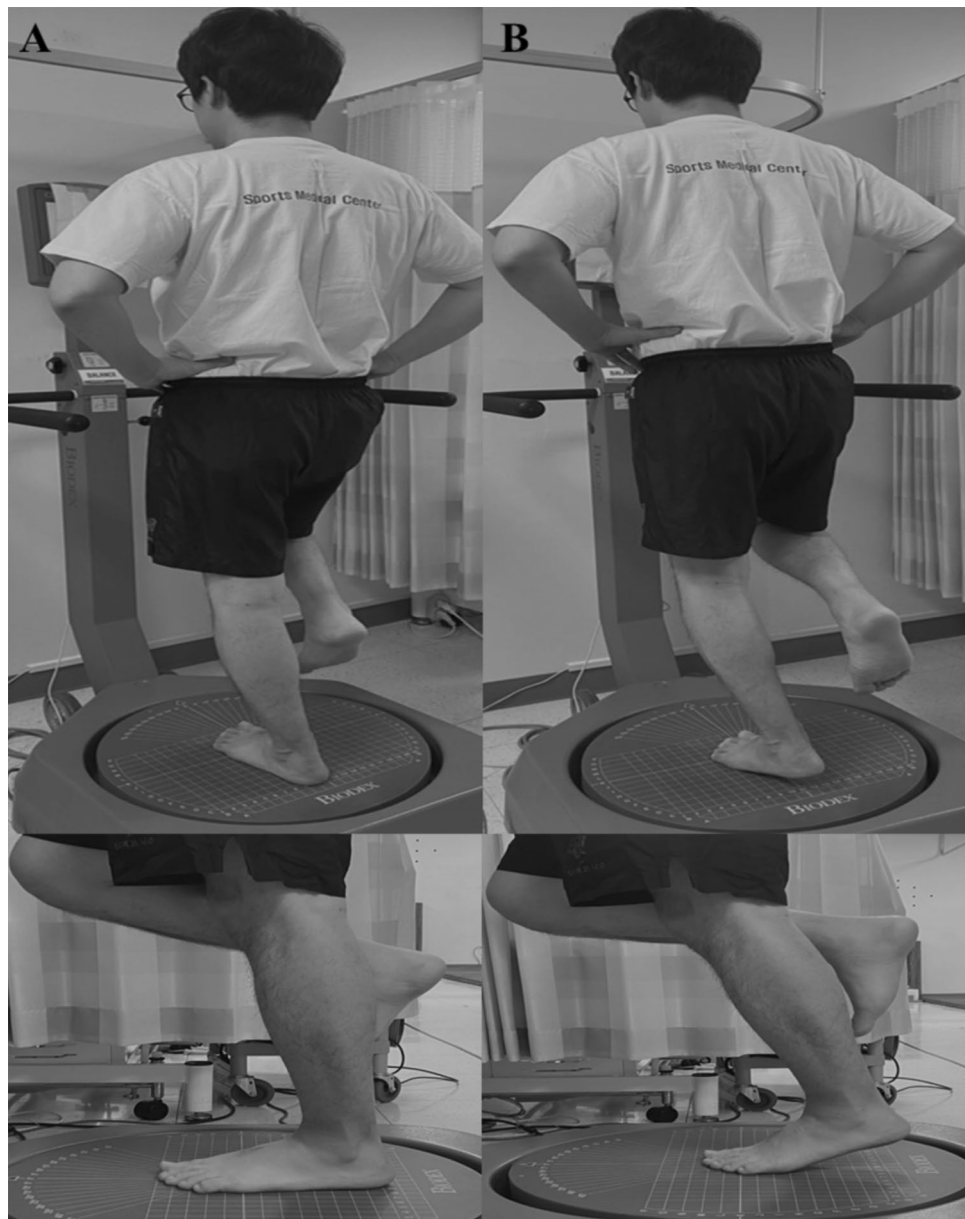
Figure 1. Static postural stability test position. The conventional static postural stability test (a) and modified static postural stability test (b).