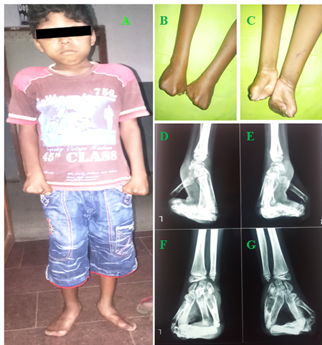
Fig. 1 Photographs showing external phenotypes of the patient and X-ray radiographs of hands. (a) Facial abnormalities, and syndactyly in hands and feet. (b) Ventral and (c) dorsal view of both hands showing severe symmetrical and tripod-shaped syndactyly. Radiographs of left hand (d, f) and right hand (e, g).