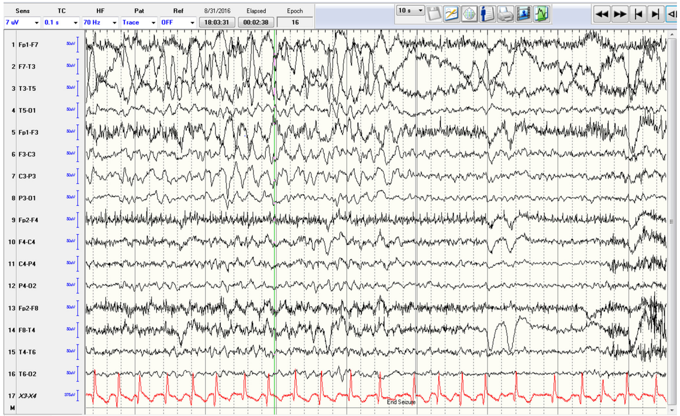
Fig. 2. End of seizure with persistent atrial fibrillation.