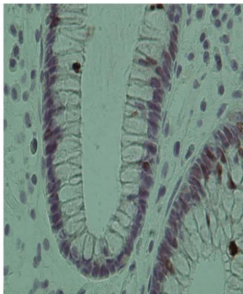
Follow-up sample from participant INT-16