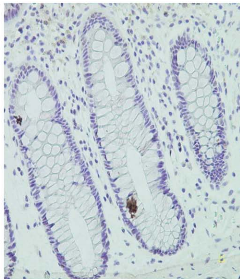
Follow-up sample from participant INT-27