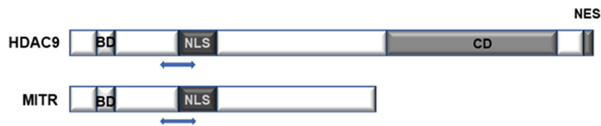
Fig. 1 Schematic diagram of functional domains of HDAC9 and MITR. HDAC9 contains a MEF2 binding domain (BD) at the N-terminus, a nuclear localization signal (NLS), a C-terminal catalytic domain (CD) and a nuclear export signal (NES) near the C-terminus. MITR is a splice

variant of HDAC9 that lacks a HDAC CD domain and NES. Double arrow heads indicate the region that HDAC9 and MITR share (450-600 amino acids) in their N-terminal domains with other members of class IIa HDACs