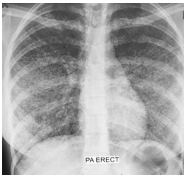
Figure 2 Anteroposterior chest radiography demonstrated diffuse reticulonodular opacities (nodular > reticular) involving the bilateral hemithorax with background ground glass haziness.

hemoglobin level of 8.5 g/dl and mean corpuscular volume of 67fL. Her platelet levels were normal at 300 \times 10^3/\mu\text{L} . Renal and liver biochemistry were within limits. Her blood group was B rhesus D positive. The urine lipoarabinomannan (LAM) was positive (Grade II) (Figure 1). Chest radiography revealed features of miliary tuberculosis with background ground glass opacities (Figure 2). Unenhanced computed tomography of the brain demonstrated a right sided large geographic area of hypodensity (19–25 HU) involving the right frontoparietotemporal cortex in the territory of the right middle cerebral artery with an associated hyperdense middle cerebral artery sign (Figure 3A and B). Sputum and blood samples were taken off for GeneXpert and cultures, respectively. The GeneXpert was positive without rifampicin resistance. Anaerobic, aerobic, fungal and mycobacterial cultures were negative. CD4+ T-cell count was 32 cell/microliter and HIV RNA viral load was unknown. Her urine human chorionic gonadotrophin was negative.