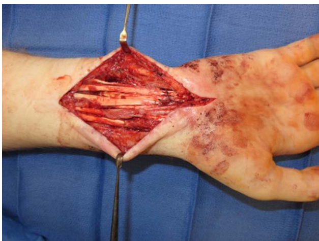
FIG. 1. Primary tenolysis procedure releasing dense fibrotic motion limiting adhesions performed 4 months after injury. The patient quickly redeveloped thick pathologic adhesions without significant clinical benefit from scar tissue release.

Tacrolimus began 1 week before surgery and lasted 11 weeks following surgery. It was administered as an oral capsule of 1–6 mg daily, and it was tapered according to the tacrolimus trough level of 5–8 µg/L. Levels were checked every other week. If a dosing adjustment was made, the level was checked the following week. The subsequent procedure consisted of a near-identical tenolysis of dense adhesions, using sharp dissection with a 15-blade knife to separate each structure. Near-normal and independent digital range of motion returned to the hand, and it was sustained at the last follow-up at more than 1 year postoperative (Fig. 4). He was able to return to work and other daily activities. The patient was counseled pretreatment on