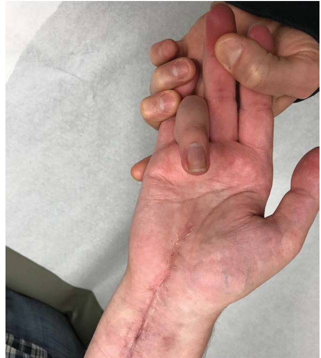
FIG. 2. The patient regained near-normal finger flexion and independent flexor digitorum superficialis function 6 weeks after secondary tenolysis treated in conjunction with systemic immunosuppressive tacrolimus therapy.

potential side effects, specifically nephrotoxicity. The use of tacrolimus for this purpose is considered off-label; however, as it is FDA approved, IRB approval was not required.