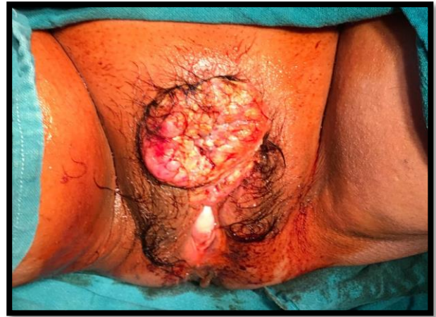
Figure 1: Clinical picture depicting the nodular growth of the vulva.

consent, radical hemi vulvectomy was done with excision of the mass along with 3cm healthy margins all around taking care of the urethral area. On deeper clearance, a small nodule measuring 1*1.5 cm was seen in the deeper tissues, lying separate from the main mass, and was resected separately.