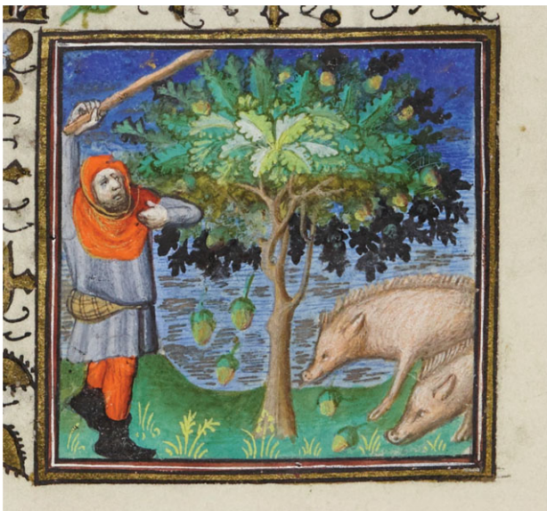
Figure 2. Another illustration of a man knocking down acorns to feed swine. From a Book of Hours , made in France in the early 15th century. Beating of oaks to knock down acorns was commonly used to illustrate the ‘Labour of the Month’ for November, when pigs were fattened prior to slaughter in December.

By contrast, the history of ‘masting’ (along with the more descriptive ‘masting behaviour’, ‘mast fruiting’ and ‘mast seeding’) as referring to the variable and synchronized production of seeds by a population of plants [14], rather than putting swine out to feed on acorns, is relatively recent. This is despite it having been long obvious to both foresters and farmers that seed crops of beech, oak and various other species varied considerably from year to year. One of the first of the former to consider the causes of masting was Georg Ludwig Hartig (1764–1837), a renowned German forester whose career included being Chief Inspector of Forests in Stuttgart and Berlin and culminated with an Honorary Professorship at the University of Berlin in 1830. Hartig suggested that periodic fruiting by European beech ( Fagus sylvatica ) was related to the period of time required by trees to build up reserves depleted during a large mast year [15], foreshadowing the resource threshold model that has shaped thinking about masting over the past 20 years.