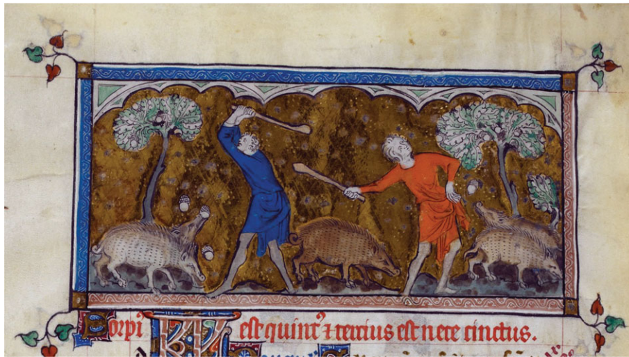
Figure 1. Men knocking down acorns to feed swine. From the Queen Mary Psalter , made in England between 1310 and 1320.