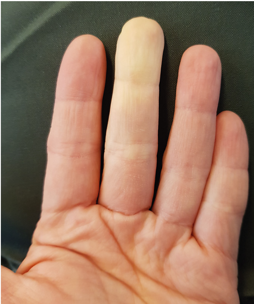
Fig. 1. Raynaud's phenomenon. Well-demarcated, white-pale, cold areas affecting the middle finger of the left hand of a 31-year old, otherwise healthy, woman.

visits after 4, 8, and 12 weeks, the patient was symptom free and did not report additional episodes. Whether this could be considered as complete recovery or attributed to the rising temperatures in spring is yet unknown. Further evaluations in the colder months are required.