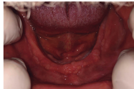
FIGURE 3: A closer view of the lower edentulous ridge showing papillary nodules at the labial aspect of the ridge.

reported together. This was thought to be helpful and handy for clinicians to find up-to-date information about this condition although for some interventions, the authors warned readers that the results were not conclusive, and more clinical research is required. This paper highlighted the most commonly used methods and their significance in the reduction of denture stomatitis. These methods were extracted from highly ranked scientific papers, i.e., the systematic reviews. It was interesting to find new approaches for the treatment of the fragile mucosa or the disinfection of the denture itself such as using probiotics [27], natural products [26], or laser [23].