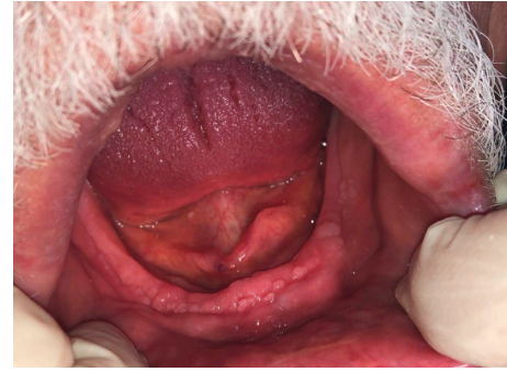
FIGURE 2: Lower edentulous ridge showing papillary nodules at the labial aspect of the ridge.

This paper represents a review of denture stomatitis, its aetiology, clinical presentation, and a summary of the recent systematic reviews regarding the treatment. It is clear that our basic knowledge has not changed much in the last decade with regard to the multifactorial nature of the condition and the need for a comprehensive management protocol to come over the risk factors or, if possible, to say the causative factors. The summary of the systematic reviews since 2010 was aimed so that the most recent critical appraisal of the scientific papers in the field is collected and