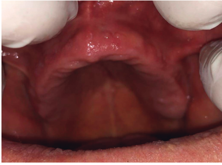
FIGURE 1: Upper edentulous ridge showing papillary nodules at the labial aspect of the ridge.

multiple small papillary nodules at the labial surface of the premaxilla (Figure 1).