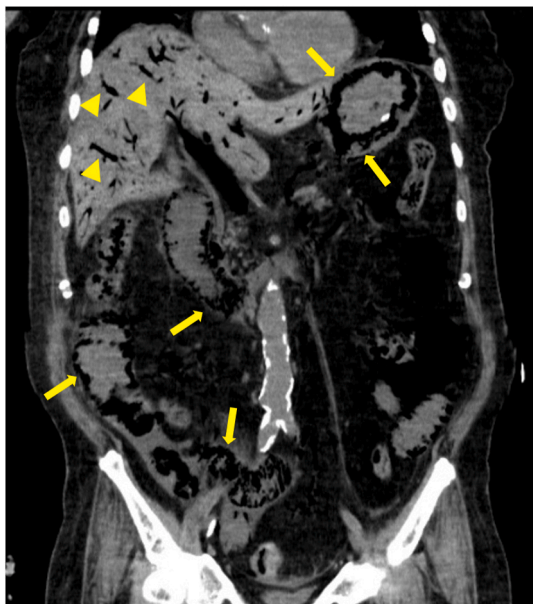
Fig. 1. Computed tomography (CT) of acute mesenteric ischemia on day 42 from the onset of coronavirus disease 2019. Portal venous gas (yellow arrow heads) and gastrointestinal pneumatocoele (yellow arrows) consistent with extensive gastrointestinal ischemic change with necrosis are found in the coronal section of the abdominal CT scan.