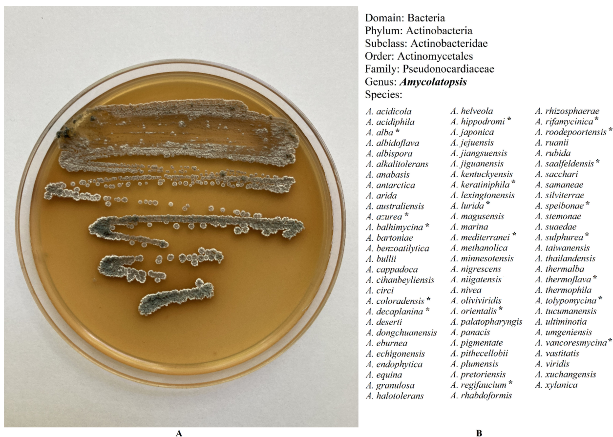
Figure 1. (A). Amycolatopsis orientalis —vancomycin producer. (B). Taxonomy position of the genera Amycolatopsis . Nomenclatural status of species: validly published [18]. Note: *—species that are described as antibiotics producers.