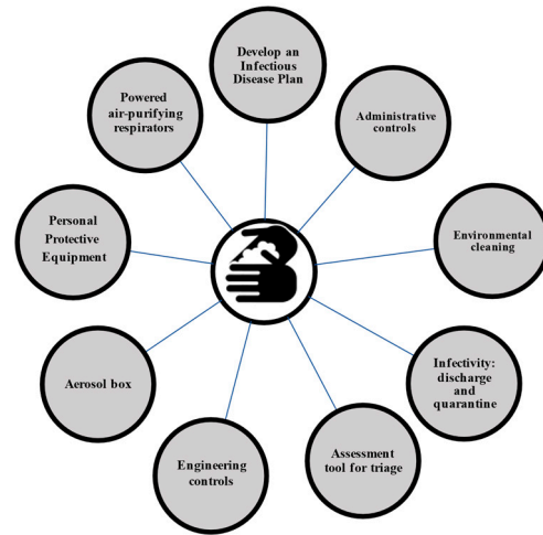
Figure 2. Infection prevention and control cornerstones in COVID-19.

may reduce the risk of exposure to multiple healthcare workers. If feasible, personnel should avoid working in both COVID and non-COVID units, as this may increase the risk of cross-transmission [25]. Figure 2 and Table 2 summarizes the IPC recommendations.