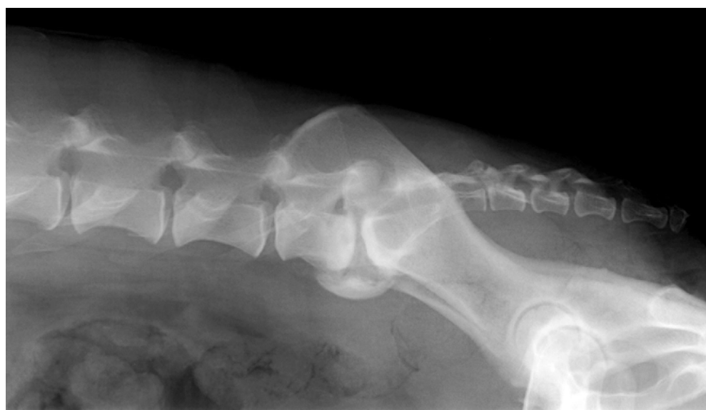
Figure 1. Laterolateral X-Ray image of dog # 4, neutral position. Severe spondyloarthritis, narrow intervertebral disc space and thickened and sclerotic endplates can be seen.

Imaging confirmation was obtained based on the presence of at least one condition considered a component of DLS (Figure 1). These conditions were previously published [1] (Table 1).