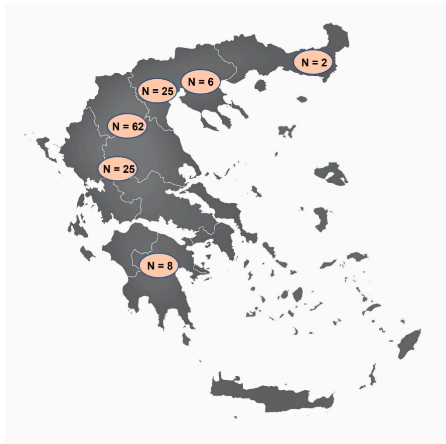
Figure 1. The map of Greece showing the areas where the examined wild boars originated from, and the number of animals (N) examined from each area.

size), compressed between two glass plates (compressorium), and examined under the stereomicroscope (20–40× magnification) and the optical microscope (100× magnification).