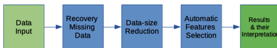
Figure 1. Block diagram of the proposed automatic variable selection model.

This work proposes a machine-learning-based system for the automatic selection of the main attributes that best explain the Cats-and-Dogs response variable (EF). This variable plays a key role in the psychological scope for the study of cognitive disability in humans. Hence, a system composed mainly of three stages is proposed. Initially, it allows the recovery of the missing data in the database, removal of correlated variables and automatic selection of the most important variables. The following block diagram shows the proposed stages (Figure 1).