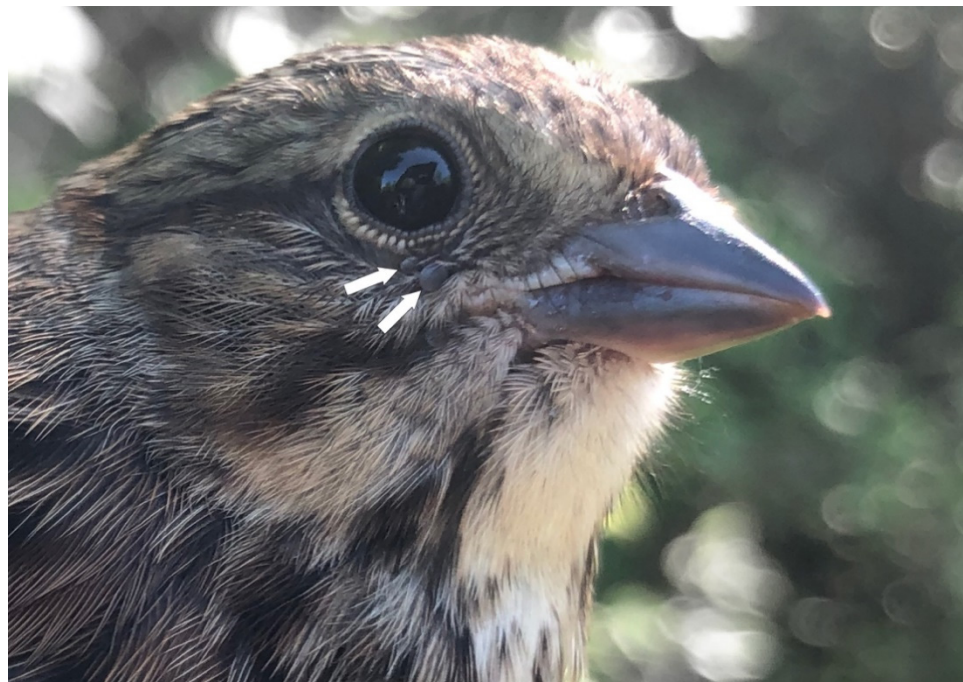
Figure 3. Song Sparrow, hatch year, parasitized by two Ixodes scapularis nymphs of which one was positive for Babesia odocoilei . These ticks were collected during the nesting period.

The source of I. scapularis parasitizing songbirds varies depending on the time of year. Throughout the temperate months, 50% of the B. odocoilei -infected I. scapularis were collected during northward spring migration, whereas 17% were obtained during the nesting and fledgling period at Montée Biggar, Quebec, in juxtaposition to the nesting spot (Figure 3). Of significance, 33% of the B. odocoilei -infected I. scapularis were attained during fall migration. Ticks acquired during nesting will account for the locally acquired ticks [34], whereas infestations on neotropical passerines, which are heading to the boreal forest to breed and rear their young [13], will represent a large portion of the ticks occurring from long-distant dispersal.