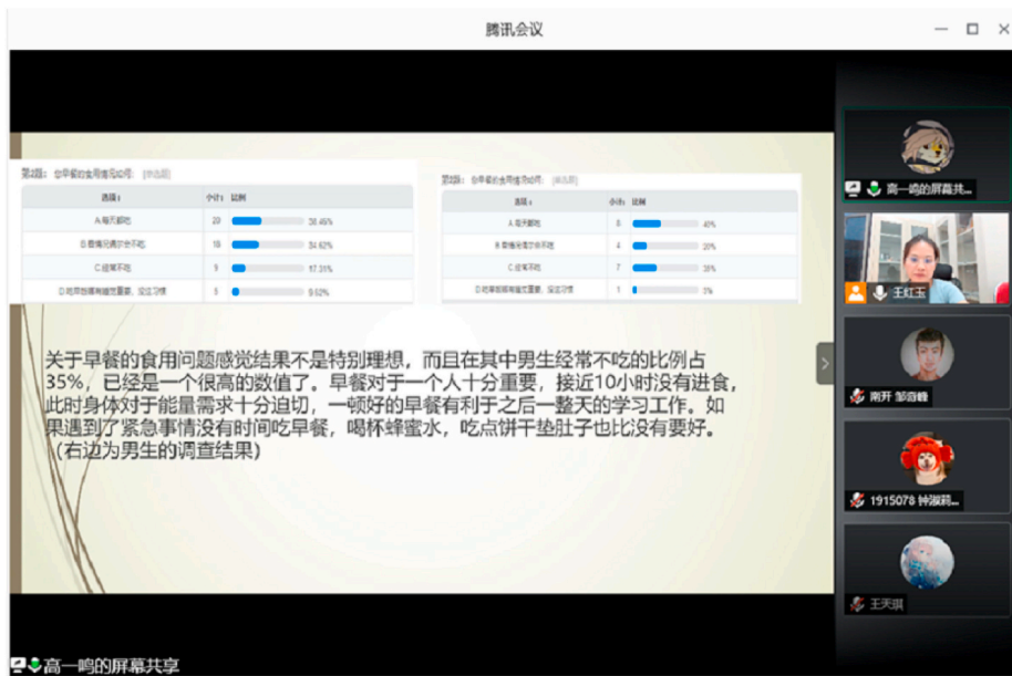
Fig. 4. Examples of presentation with Tencent conference.