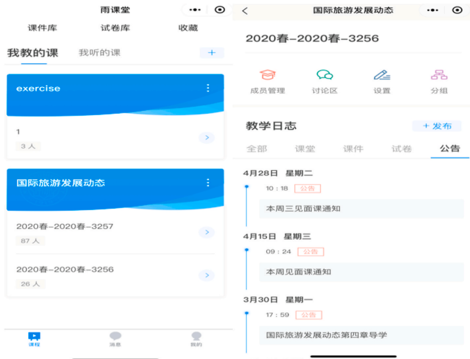
Fig. 3. Examples of notice released with Rain classroom.