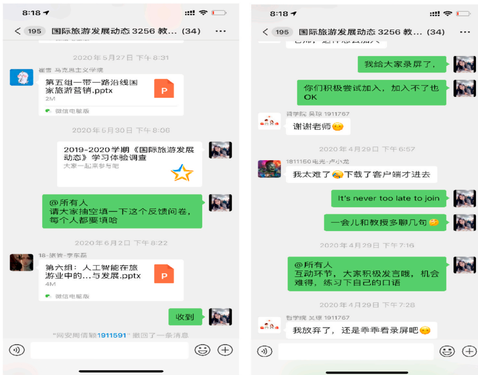
Fig. 5. Examples of interaction by WeChat.