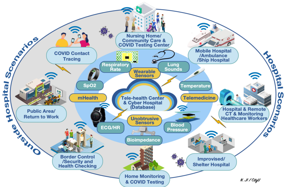
Fig. 1. Application scenarios for wearable sensors during pandemics [3], [4].

with molecular testing related to the COVID-19 and/or acute CVD symptoms in real world scenarios (see Fig. 1) [3], [4], has a huge potential to address this challenge and are expected to be better integrated in the inside/outside hospital workflow [5]. However, wearable sensors and mHealth have not been fully utilized in pandemic control to date. In this work, specific application scenarios encompassing the use of wearable sensors and mHealth in closed-loop management of acute CVD patients during the COVID pandemic are proposed. This could help to triage patients before hospitalization and provide opportunities to remotely monitor the health status of both patients and caregivers so as to limit virus spread and avoid cross-infections while assisting to provide emergency services timely to acute CVD patients.