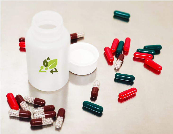
Figure 2 Will we see drugs with eco-label?

performed on-site to effectively remove all drugs before they reach the municipal WWTP[74].