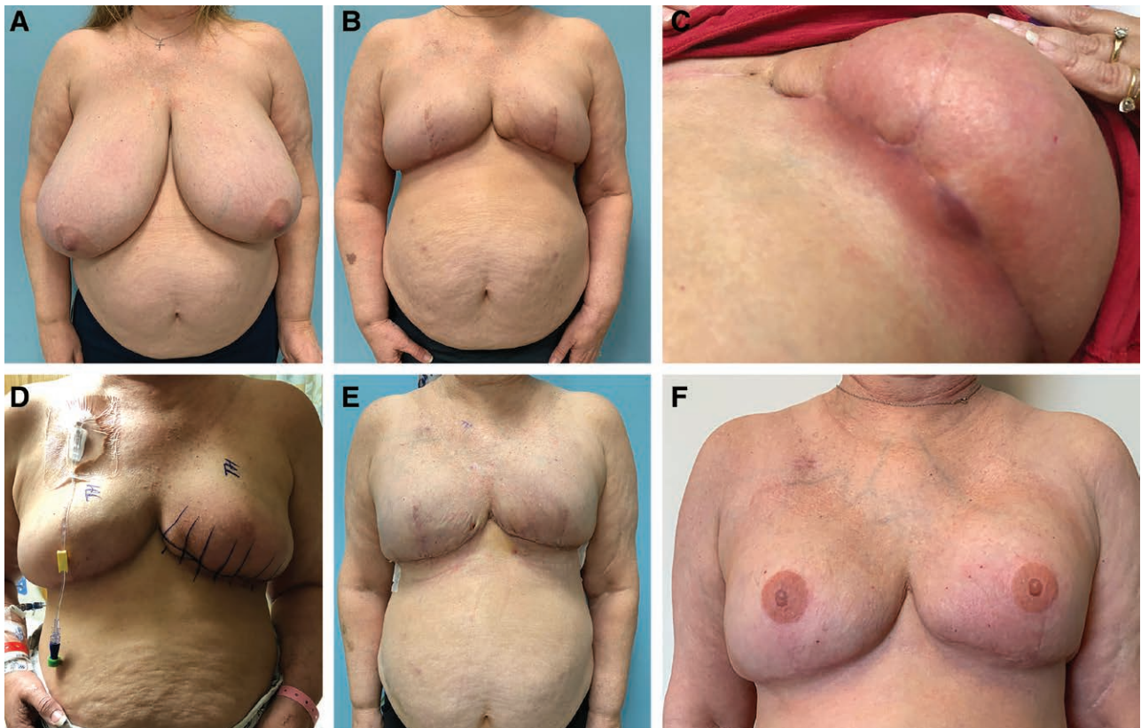
Fig. 3. Case 13. Preoperative photograph of a 51-year-old woman with left breast IDC (A). The patient underwent a unilateral kidney transplant over 20 years prior, and was on chronic immunosuppressants at the time of infection. She underwent a left therapeutic skin-reducing mastectomy and prophylactic right skin-reducing mastectomy with Ryan flaps and immediate placement of bilateral 800 cm 3 prepectoral tissue expanders in March 2019 (B). In June 2019 during adjuvant chemotherapy, she developed moderate to severe cellulitis of the left breast (C) and underwent immediate washout, removal of tissue expander, and placement of V.A.C. VERAFL0 (D). After 4 days of IV antibiotic therapy and NPWTi-d with Prontosan, she underwent simultaneous bilateral breast reconstruction with permanent silicone gel implants (E, 11 days postoperative). She recovered well with no further issues and had nipple tattoos in January 2020 (F).

Of the 16 patients who presented with peri-prosthetic infection and underwent single application NPWTi-d, three presented with subpectoral implants. These subpectoral reconstructions were performed in 2016 and as recently as early 2017, after which both providers transitioned to prepectoral placement of implants. Our practice now exclusively performs prepectoral breast reconstruction. Additionally, the vast majority of our reconstructions are DTI with no need for interval tissue expanders and subsequent implant exchange. As such, our approach is quite different from other studies whose authors only report subpectoral reconstruction. 15,16,29,30 Some practices may be