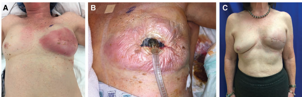
Fig. 1. Example of surgical intervention in single-application NPWTi-d protocol (case 4 from Tables 1 and 2). Patient presented with left breast cellulitis (A) and underwent immediate washout with removal of prepectoral tissue expander and placement of V.A.C. VERAFL0 (B). After 26.5 hours of NPWTi-d therapy, the device was removed and a permanent prepectoral implant was placed. Patient 14 days after NPWTi-d (C).

To analyze the cost of care, the volume and cost of office visits and hospitalizations were calculated. The volume of office visits to the plastic surgery clinic was manually abstracted, and an average cost of $107 per visit was used for all clinic encounters based on previously published time-driven activity-based unit costs 22 and an estimated 25 minutes per encounter. The total variable cost of all hospital encounters was extracted from the institution's activity-based cost accounting system (CostFlex Systems Inc., Mobile, Ala.). Direct utilization and costs were compared between groups using two-sided independent samples t -tests, and an economic model was developed for projecting the cost savings associated with using V.A.C. VERAFL0 in a cohort of