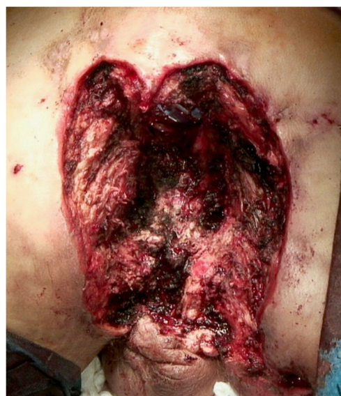
Fig. 3 Abdominoperineal resection and excision of the perineal tumor resulted in a wound with a cavity of approximately 35 × 25 × 25 cm

femoral artery (Fig. 4). Subsequently, the patient returned to the operating room and the AV loop was transferred to the perineal region. A free latissimus dorsi (LD) myocutaneous flap was harvested (size, 38 × 28 cm). The apex of the AV loop was cut, and arterial and venous anastomoses were completed in standard fashion with interrupted sutures. The muscular part of the flap was covered with split-thickness skin grafts from the lateral thigh. Two 12 Charrière, negative-pressure surgical drainages were inserted between the flap and the underlying tissue (Fig. 5). Additionally, the complete split-thickness skin grafted muscular part of the flap was covered with large polyurethane foam and consistent negative pressure therapy for 5 days was started. After removal of the negative pressure system, we observed a partial peripheral necrosis of the flap (9 × 3 cm). Therefore, 11 days after defect coverage, the patient returned to the operating