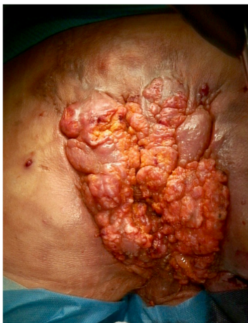
Fig. 1 Extensive inflammatory perineal tumor with multiple perianal fistulas (20 × 10 cm)

Three subsequent surgical debridements were necessary to prepare the surgical site for the final wound closure. Prior to defect reconstruction, due to poor quality of local perforator vessels and bilateral resection of superior and inferior gluteal vessels during abdominoperineal resection, a first surgical step established an arteriovenous (AV) loop. For this, the right great saphenous vein was mobilized and anastomosed to the lateral circumflex