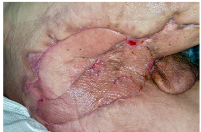
Fig. 6 Result 7 weeks postoperatively

Radical surgical excision with negative margins is the therapy of choice for VC [7, 12, 13]. Due to severe inflammation with multiple abscesses of the perianal and perineal region, abdominoperineal resection with wide tumor excision was the only curative treatment option for the patient (Figs. 1 and 2). Surgery resulted in a large cavity with a partially exposed sacrum (Fig. 3). A common and well-established technique for reconstruction of perineal defects is the vertical rectus abdominis muscle (VRAM) flap [1, 14–16]. However, in this case, extensive scarring after previous laparotomy, in addition to the size of the