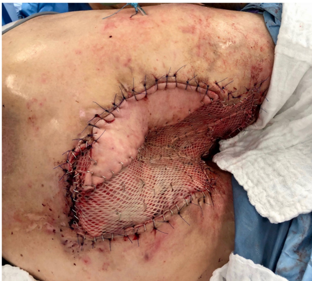
Fig. 5 Intraoperative view with free latissimus dorsi myocutaneous flap inserted to reconstruct the perineal defect, the muscular part of the flap was covered with split-thickness skin grafts

After reconstructive surgery, the patient was transferred to the Intensive Care Unit (ICU) and consequently placed in a lateral decubitus position. Mobilization was commenced 7 days after free flap transfer. During the course of the subsequent treatment, the patient developed acute cardiac decompensation (LVEF of < 10%) and consequently acute liver failure, which significantly prolonged the inpatient stay. After stabilization and treatment of cardiac failure, LVEF and liver function gradually recovered. The patient was equipped with a LifeVest® and discharged 69 days after his last surgical procedure (Fig. 6).