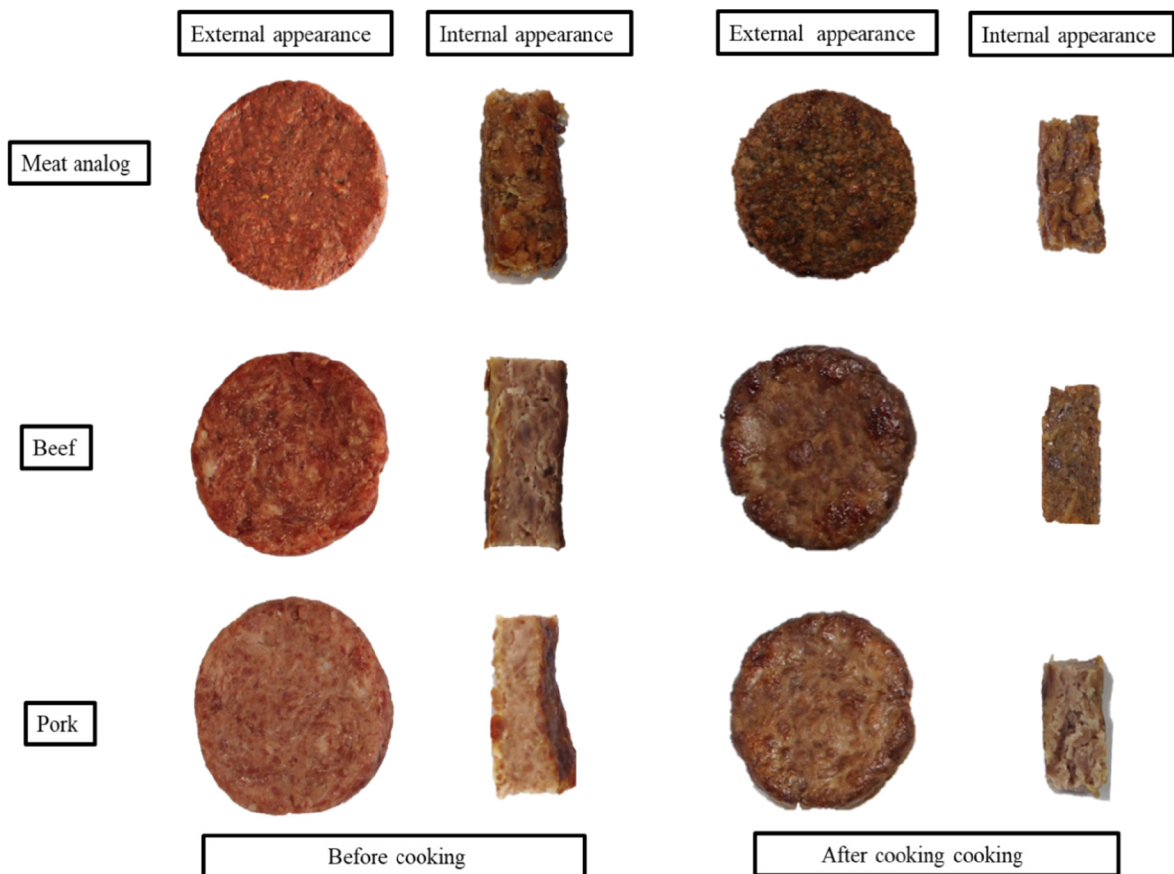
Fig. 2. External and internal appearance of meat analog in relation to beef and pork.

The visible (external and internal) appearance of cooked and uncooked beef, pork, and MA patties has been shown in Fig. 2.