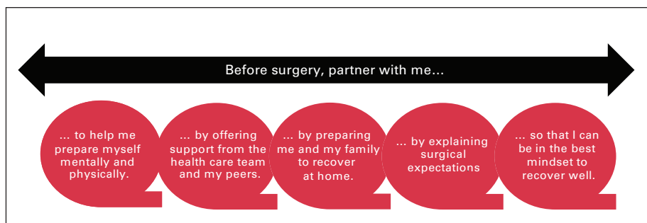
Fig. 3. A patient-oriented preoperative program has the potential to ameliorate deterioration during the waiting period for surgery and promote a mindset to recover well. It is essential to recognize that preoperative preparation should occur on a continuum that meets patients where they are at and in a partnership that respects patients' expertise and desired level of engagement.

care professionals during this time. Many also perceived deterioration of their mental (e.g., anxiety) and physical (e.g., weight loss) states, and the longer they waited for surgery, the greater the deterioration.