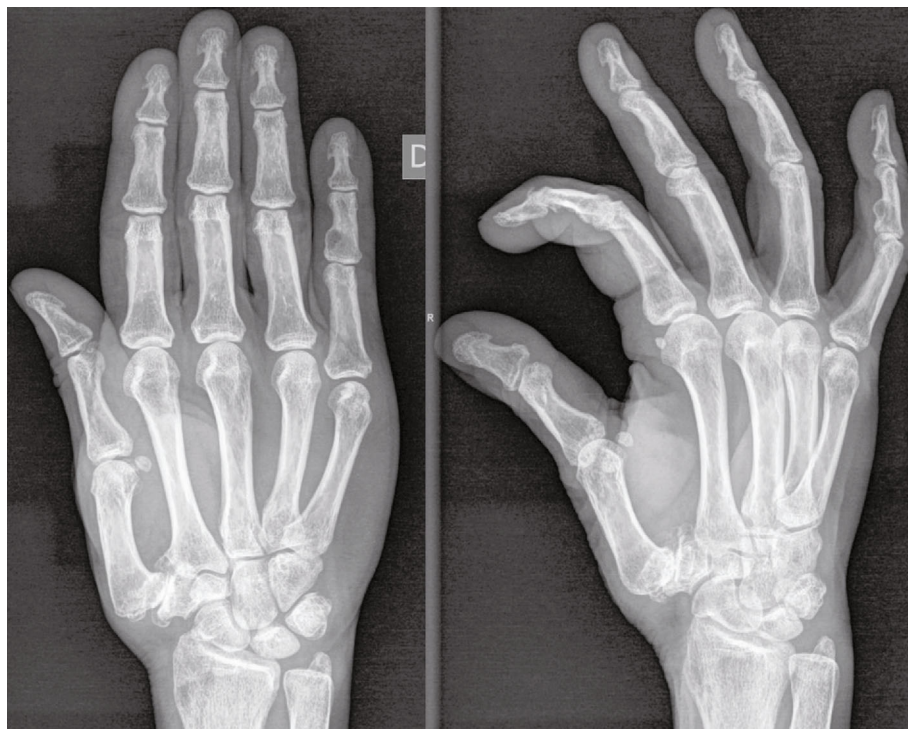
FIGURE 1: Initial X-ray showing trapeziometacarpal osteoarthritis.