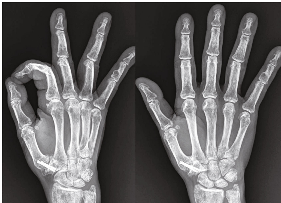
FIGURE 4: Final radiograph showing the arthrodesis of the trapeziometacarpal joint of the right hand.

that area (Figures 3(a)–3(c)). With this approach, we have good access to the joint (Figure 3(d)).