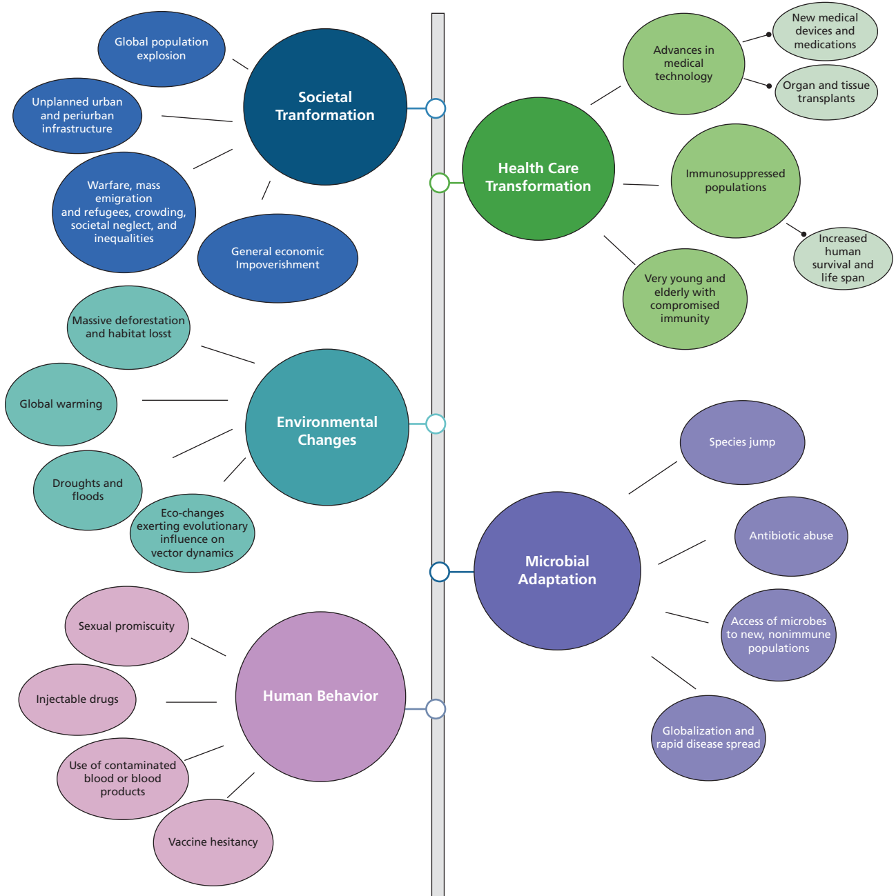
Figure 2. Reasons for the emergence of new infections leading to epidemics and pandemics.

infecting an intermediate host, pangolin ( Pholidota order), may have initiated the COVID-19 pandemic, as pangolins are consumed as food in China. 9