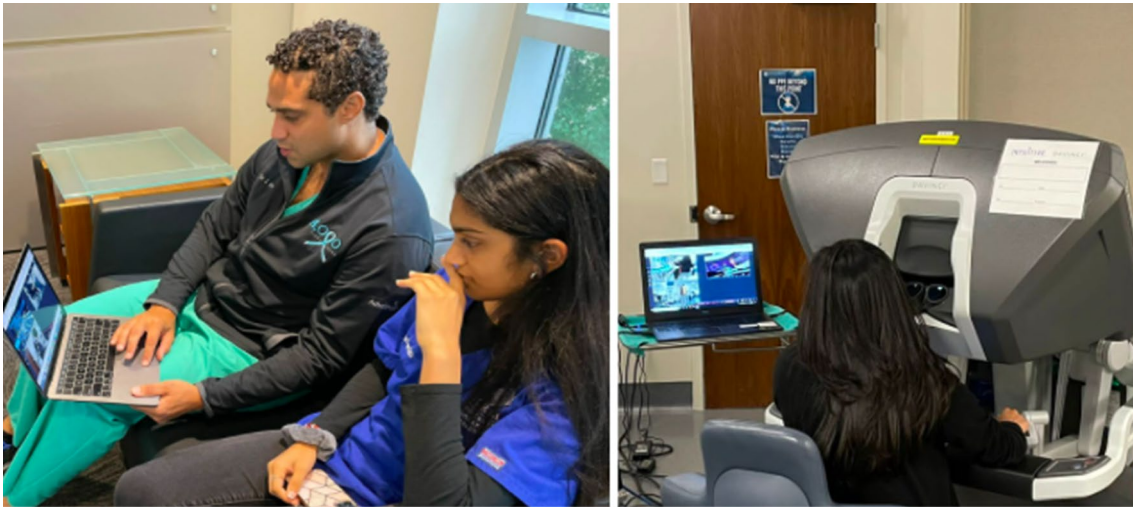
Fig. 4 Two mentors (left) telementoring a participant (right) on the dVSS in a separate floor of the building, by verbal instruction and telestration