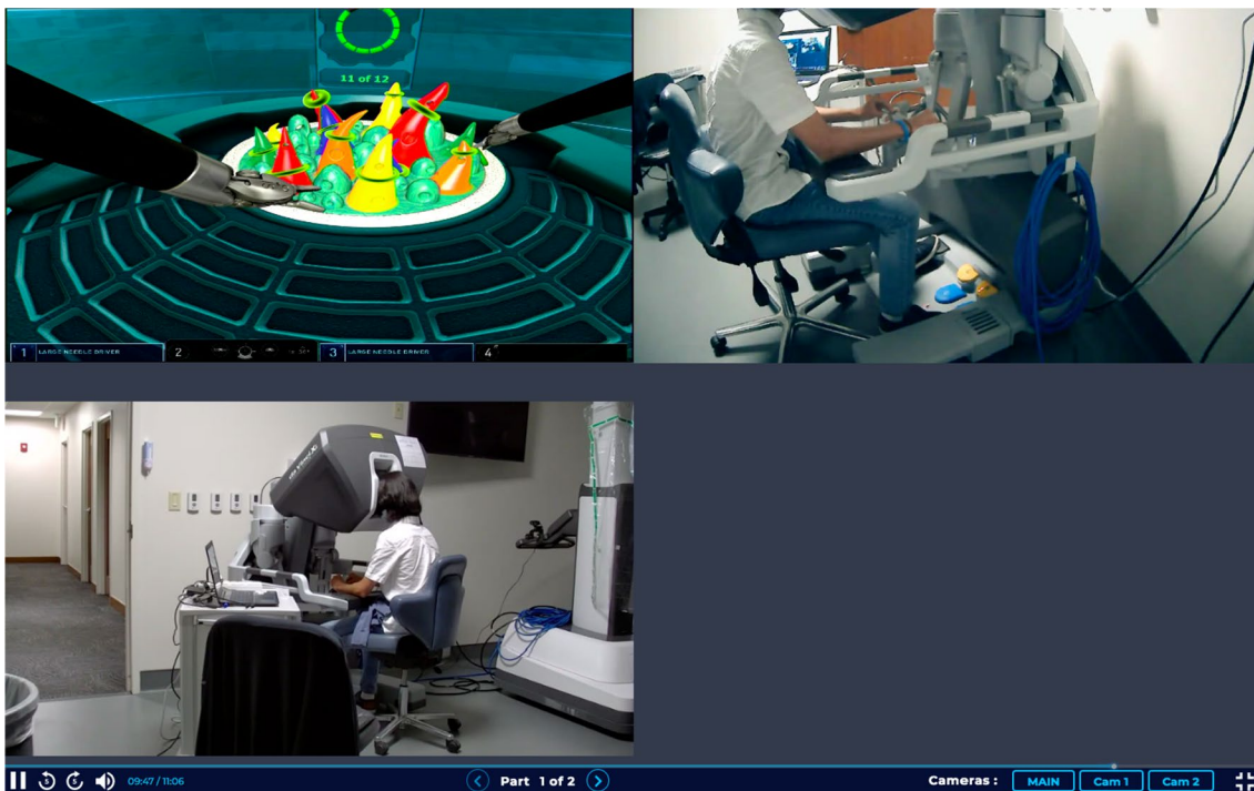
Fig. 3 Participant at dVSS. Proximie captures a simulator view (top left) and an external view of the user at console (top right and bottom left)

all research standards and ethics. The student's adaptation to the simulation exercises was seamless and was further hastened when teleproctored through the platform. This usability of the Proximie platform determines its potential applicability in sectors complimented by healthcare, such as defense [11]. The ease of a robotic surgical nurse or soldier setting up such a system will benefit the mentor and mentee.