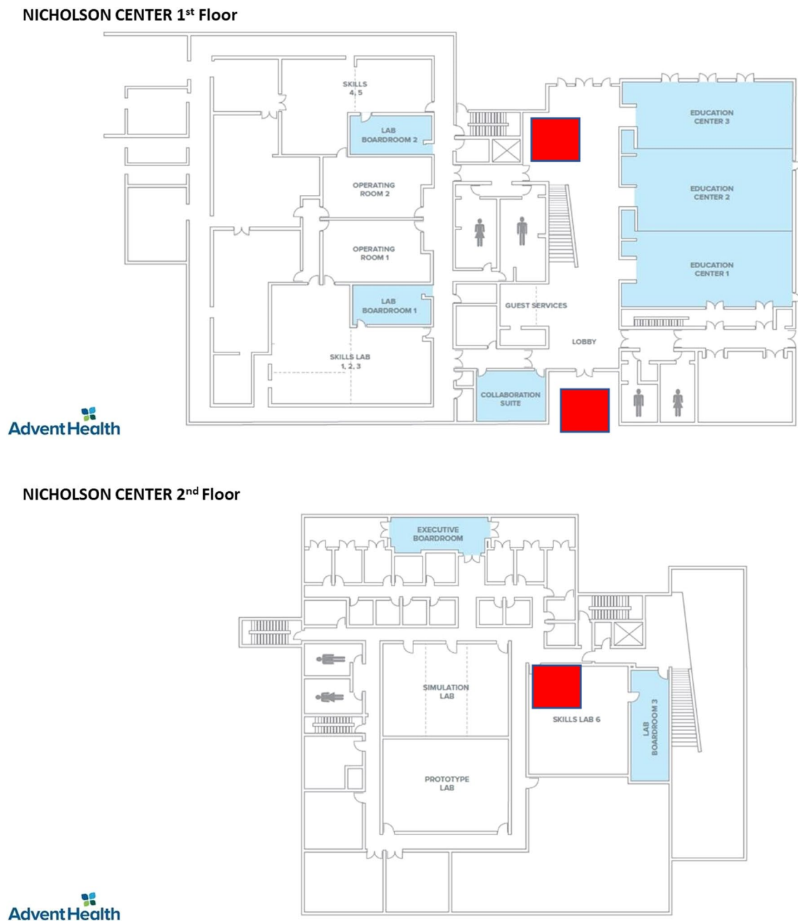
Fig. 2 Floor Plans of Nicholson Center (AdventHealth website). Red squares indicate Mentors and Mentees locations