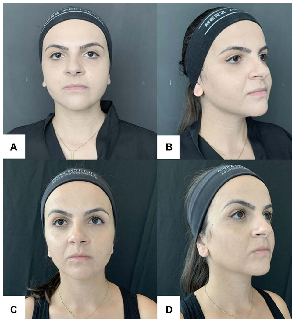
Figure 4 Woman, 36 years old; (A and B) Before procedure; (C and D) 180 days after procedure: discrete slimming of the middle third of the face and marked improvement of jawline 180 days after procedure.

After delimitation, the topical anesthetic was washed off, and an ultrasound gel was applied to the skin immediately before energy delivery. The technology used in all the cases was Ulthera ® (Merz Aesthetics ® , Frankfurt, Germany) based on the following protocol. First, 4-MHz – 4.5-mm transducers were applied in the first area with 35 homogeneous shots per vertical column and, in area two, with 10 centered shots each column.