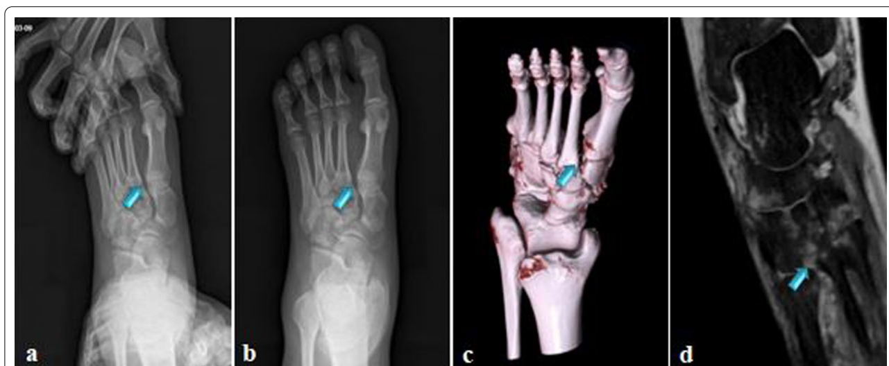
Fig. 1 a–d Preoperative stress view, anteroposterior (AP) foot radiograph, weight-bearing CT and MRI of 27-year-old male patient with purely Lisfranc ligament injuries (blue arrows showing injury)

The mean interval from the initial injury to the operation was 4.5 (range 3–8) days (Table 1). After the operation, the limb was raised and a short-leg plaster splint was used to fix the ankle in 90° for 6–8 weeks. The foot was allowed to bear partial weight until the plaster splint was removed. By 3 months, the patients were able to walk with full weight and they had returned to almost full