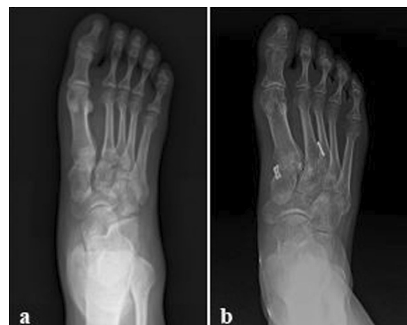
Fig. 4 a, b Anteroposterior (AP) foot radiograph of early postoperative and the last follow up

The Tightrope system was not removed after operation and the average follow-up time was 20.5 months (range, 17–24). All the incisions healed in the first stage, and there were no immune rejection, incision infection in post-operation. Moreover, no screw loosening, plate fracture or other complications occurred during the follow-up time. At 3 months ( 1.7 \pm 0.4 ), 6 months ( 1.8 \pm 0.4 ) after the operation and the last follow-up ( 1.9 \pm 0.5 ), the distance between the first and second metatarsal joint was significantly shorter than preoperative ( 8.9 \pm 3.7 ) ( P < 0.05 ) (Fig. 4). Similarly, VAS score decreased from 7.1 \pm 1.0 in preoperative to 1.8 \pm 0.6 , 1.7 \pm 0.9 , 1.5 \pm 0.7 , respectively ( P < 0.05 ). Nevertheless, there was no significant difference between the time points after operation ( P > 0.05 ) (Table 2). These data showed that the foot obtained a better biomechanical stability, and there was no obvious reduction loss and the symptoms of foot