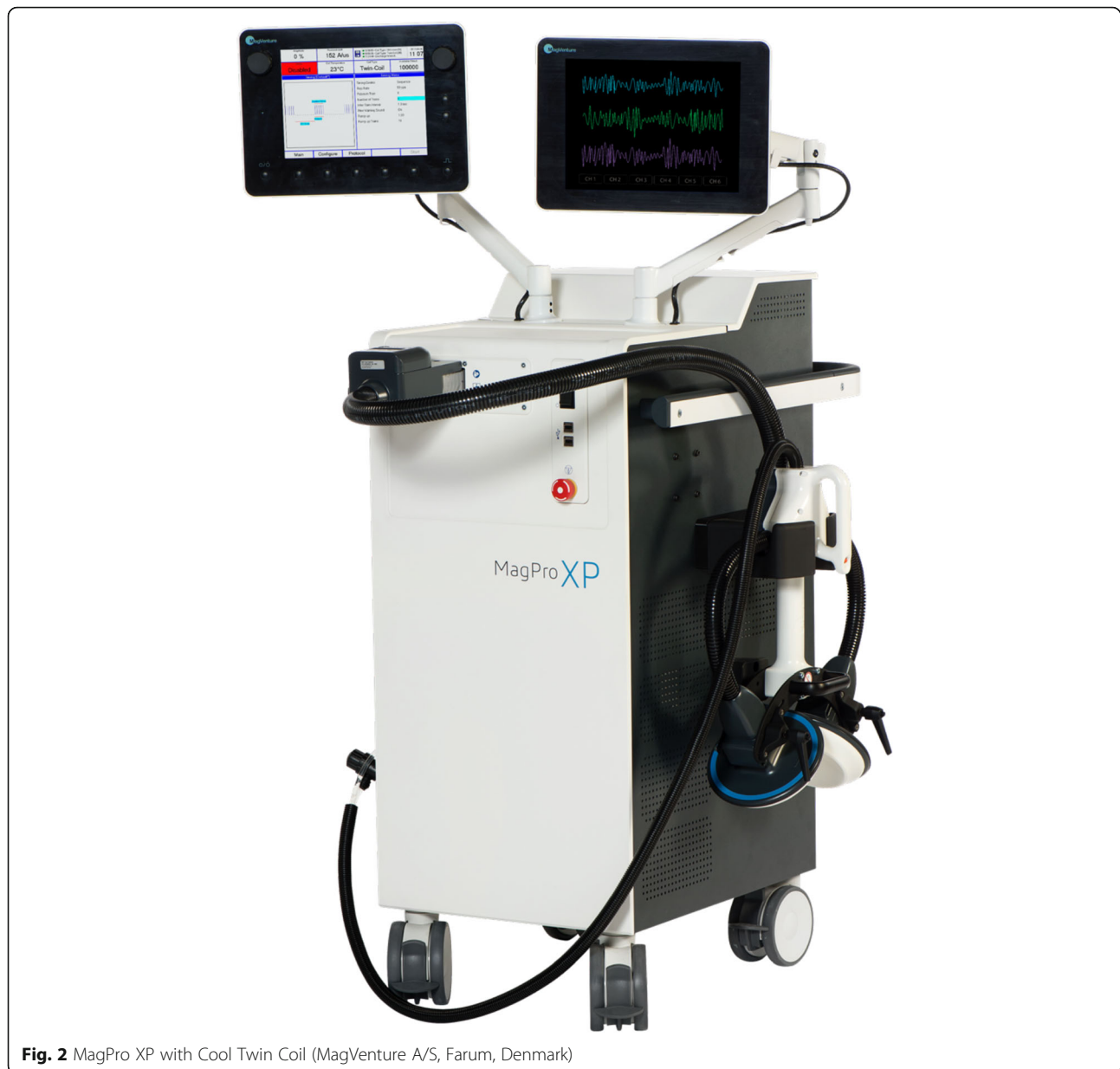
Fig. 2 MagPro XP with Cool Twin Coil (MagVenture A/S, Farum, Denmark)

MST. This process is repeated based on the HRSD-24 total scores from both treatments 9 and 12, and parameters are adjusted accordingly. If at any point the patient is already at maximum stimulation (568.3 mC or 1000 pulses) the treatment continues with the parameters unchanged.