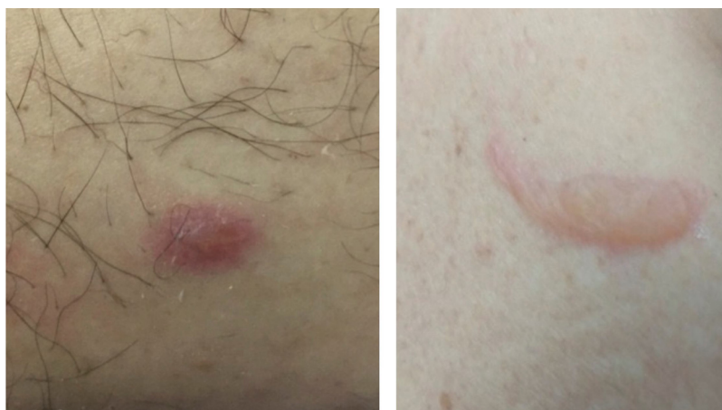
Figure 2 Vesico-bullous lesions in a patient with COVID-19.