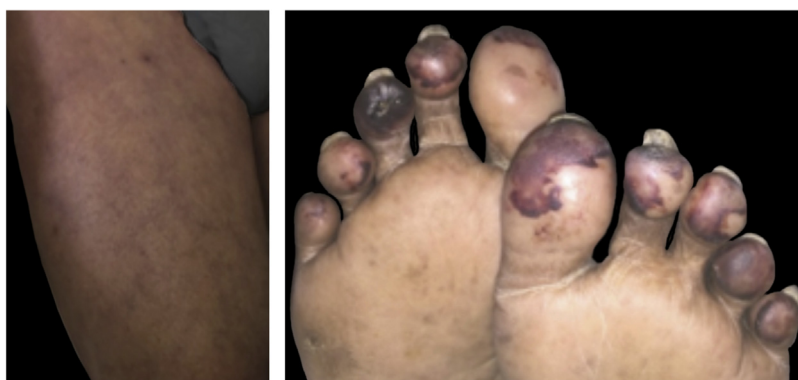
Figure 3 Livedo racemosa, purpura and necrosis of the extremities in a patient with COVID-19.