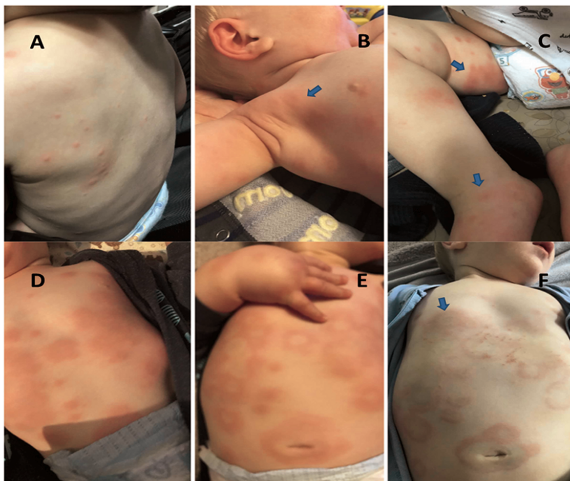
Figure 1. (A) Initial SSLR lesions (inflammatory papules). (B, C, F) Erythematous/annular lesions with purplish central discoloration simulating EM's target lesions (blue arrows). (E) Severe joint inflammation accompanied by overlaying erythema. (D, E, F) Erythematous lesions that converge in plaques and later evolve in annular lesions with central clearing. Notice how skin lesions remain in the same location for several days unlike true urticaria.

history of drug exposure. Although SSLR has been previously associated with vaccines and some infectious agents as potential triggers, there are no publications that accurately assess the role of these agents in the etiology of this condition in children (19), although several case reports and case series in adults have suggested an association between H1N1 influenza vaccination and SSLR. In our study, there were no cases of SSLR associated with vaccines.