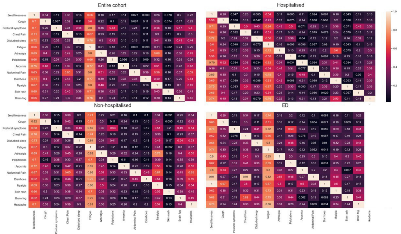
Figure 3 Co-occurrence of symptoms at first assessment of 1325 individuals referred to the post-COVID-19 assessment clinic. ED, emergency department.

in 5.8%, troponin T in 13.4%, creatine kinase in 16.9%, alanine transaminase in 18.0% and D-dimer in 18.9%. Abnormal blood investigations were more common in PH than in NH individuals (D-dimer: 28.3% vs 10.3%; troponin T: 27.0% vs 4.7%; NT-proBNP: 17.0% vs 0.0%; and eosinophil count: 6.8% vs 2.5%) (online supplemental table 2).