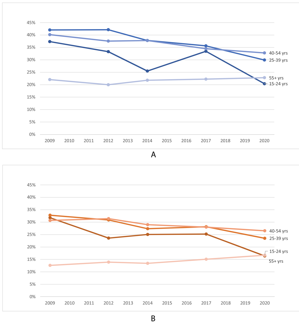
Fig. 1 Trends in current smoking among men (A) and women (B) according to age in European Union. Data from Eurobarometer surveys waves 72.3 (2009), 77.1 (2012), 82.4 (2014), 87.1 (2017) and 93.2 (2020)

European data on exposure to SHS in restaurants. While in most central and northern European countries fewer than 5% of the respondents reported recent SHS exposure in a restaurant in 2020, there are countries like Cyprus where 40% of people who recently visited a restaurant reported being exposed to SHS [21]. Given the lingering presence of THS in environments where people smoke or where smokers are [14–16], the proportion of women and children exposed to THS is likely even higher. The picture is further complicated by the recent rise in popularity of e-cigarettes and heated tobacco products. Although current use of these products is not widespread, they are quite popular in certain countries and among younger ages, including women of childbearing age