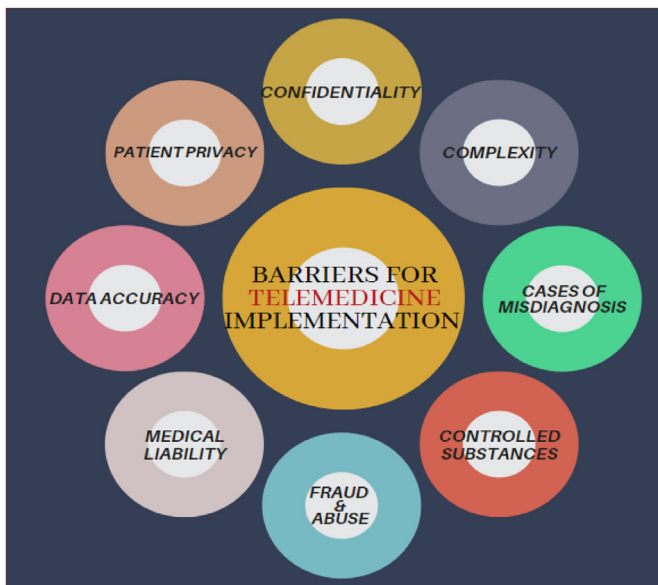
Fig. 3. Frequent barriers in supporting healthcare through telemedicine.

Although advancements in medicine have made it easier to use technology, device outages occur from time to time. Healthcare systems that are considering adopting telemedicine technologies meet with industry experts. They have a host of realistic options for practitioners interested in incorporating telemedicine into their clinics, making the integration smoother [60,61].