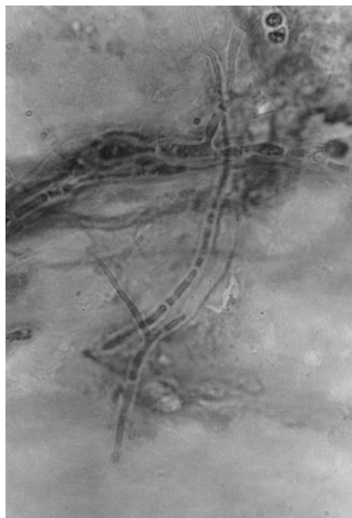
FIG. 1. Potassium hydroxide wet preparation of the corneal scrapings. Magnification, \times 960 .

On 14 August 1997, inflammation recurred in the anterior chamber with pupillary block and hypopyon and hyperemic conjunctiva. Treatment with itraconazole (100 mg twice daily) and systemic corticoids was initiated. By 11 November 1997, the patient had improved substantially, and there was no more inflammation. She was discharged. On 9 December 1997, the patient returned, complaining of visual acuity reduction and, under examination, a uveal tract reaction, which was characterized by precipitates on the posterior surface of the cornea, was observed. Pred-fort and atropine drops were prescribed.