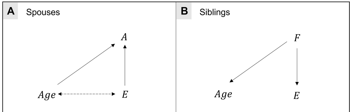
Fig 1. Causal diagram illustrating collider bias in within-spouse pair and within-sibship models. A) To illustrate collider bias in the context of spouses, consider a model with age and educational attainment ( E ) which are assumed here to be independent. Assuming that spouses assort on similarities for age and education, it follows that spousal assortment ( A ) is a common effect of age and education similarities. In a within-spouse pair model, adjusting or accounting for A would induce associations between age and education similarities. For example, if a spouse-pair have a large difference in age, then they must be similar for education. B) Contrastingly, for a within-sibship model, it is less plausible that age and education influence the sibling's family F , as age and education are post-birth phenotypes. Therefore, adjusting for F is unlikely to induce an association between age and education.

https://doi.org/10.1371/journal.pgen.1009883.g001