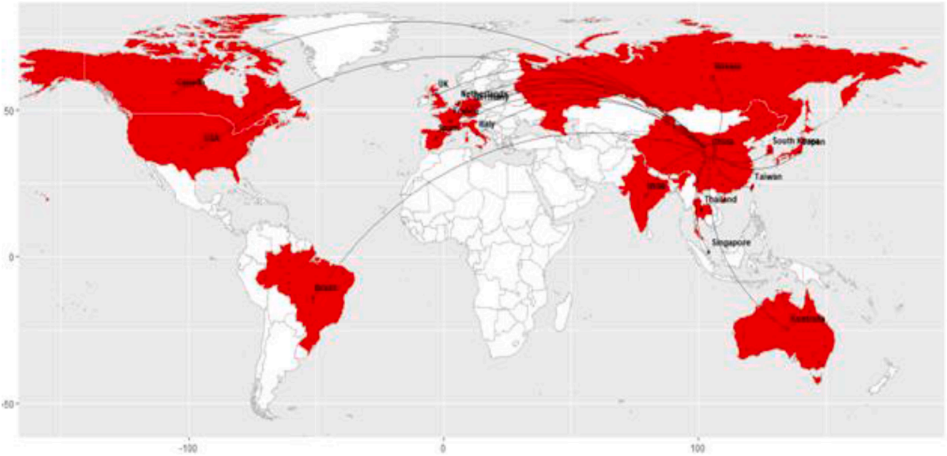
Fig. 1. China and its major trading partners.