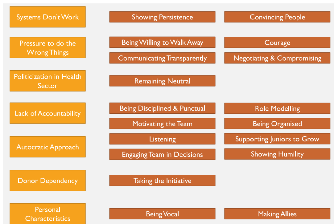
Figure 3. Key leadership capabilities to navigate contextual challenges in Sierra Leone. Leadership capabilities (brown boxes) are positioned next to the contextual challenges (orange boxes) they help to overcome.