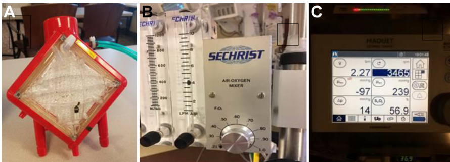
Fig. 1. Examples of (A) membrane lung, (B) flowmeters for oxygen delivery and "sweep gas" regulation, and (C) ECMO pump device.

The primary goal of supporting a patient with VV-ECMO is to promote lung rest via lung-protective ventilation. 8,9 Lung-protective ventilation aims to decrease the incidence and severity of ventilator-induced lung injury (VILI) associated triggers such as volutrauma, barotrauma, atelectrauma, and biotrauma. 8 The advent of currently accepted lung-protective ventilation strategies arose from the recognition in animal