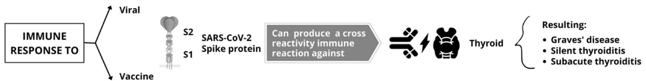
Fig. 3 The natural or acquired immune response against protein S of SARS-CoV2 due to the structural similarity with some human antigens can generate a cross reactivity immune reaction against the thyroid gland

In addition, in 2021, Vodjani et al. demonstrated cross-reactivity to human antigens of antibodies against protein S and the nucleocapsid of SARS-CoV2 [27] (Fig. 3). This would explain, at least in part, some of the autoimmune/inflammatory reactions produced during SARS-CoV2 infection and also by the vaccine. Thus it is possible that proteins generated due to the vaccine cross-react with thyroid target proteins due to the molecular mimicry triggering autoimmunity together with an inflammatory reaction in genetically predisposed individuals [20, 27]. These phenomena could be enhanced by adjuvants in the context of post-vaccination ASIA. The observation that most cases occurs few days after vaccination, in a time when viral proteins reach its peak would support this hypothesis [14–16, 20].