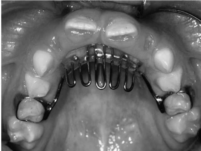
Figure 1. Model of palatal crib used in the study.

pumice and water; the region was then isolated. The appliances were cemented with glass ionomer (Vidrion C, SS White, Rio de Janeiro, Brazil). Figure 1 illustrates the FPC used.