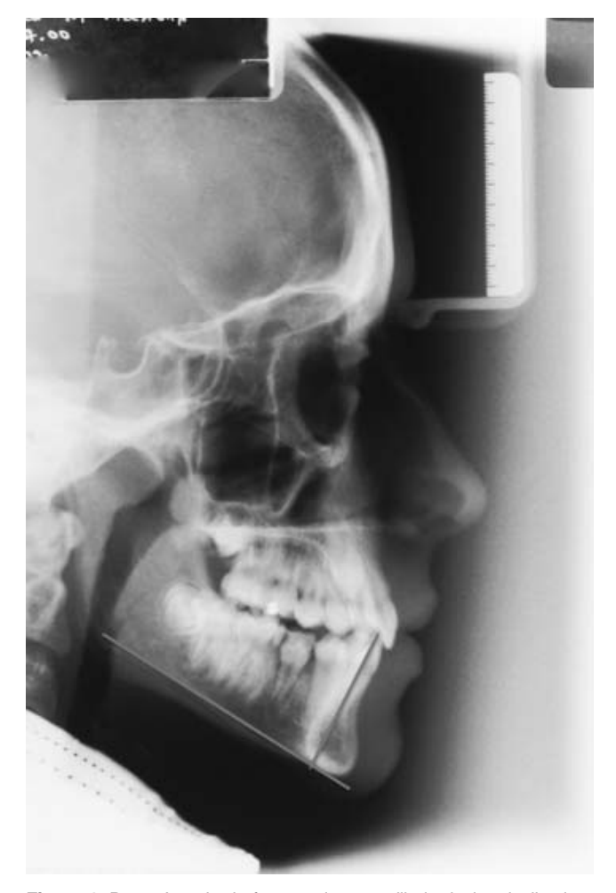
Figure 1. Downs' method of measuring mandibular incisor inclination.

The aim of this study was to compare the mandibular incisor proclination produced by fixed appliances and third generation clear aligners (Invisalign) when treating patients with mild mandibular crowding.