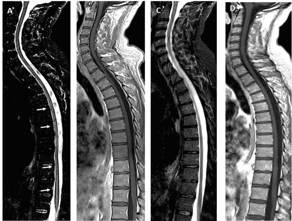
Fig. 1 MRI of spinal cord at onset on short tau inversion recovery (STIR) images showed large confluent lesions extending over multiple segments until conus (white arrows) (A) without cord swelling and without enhancement after gadolinium on T1-weighted image with gadolinium (B). Three months later on STIR images disappeared completely hyperintense streak (C), none enhancement after gadolinium on T1 weighted image (D)

and later with piperacillin/tazobactam. Which was stopped on the basis of negativity both of PCR and cultural CSF microbiological panel (including E. coli , Listeria monocytogenes , Haemophilus influenzae , Streptococcus pneumoniae and S. agalactiae , Cytomegalovirus , Enterovirus , herpes simplex 1,2,6, parvovirus, echovirus, varicella zoster virus and Cryptococcus , and JCV quantitative). Autoimmune screening was normal too. Aquaporin-4 antibodies was negative. A positivity to anti-MOG was confirmed with a titer 1:2560 (positive \geq 1:160). The screening test anti-SARS-CoV2 IgG and IgM, performed to exclude a transverse myelitis COVID 19-related (2), was also negative. Based on vaccination history, we searched and did not detect neutralizing antibodies and antigen-specific T-cell against SARS-CoV2 spike protein.