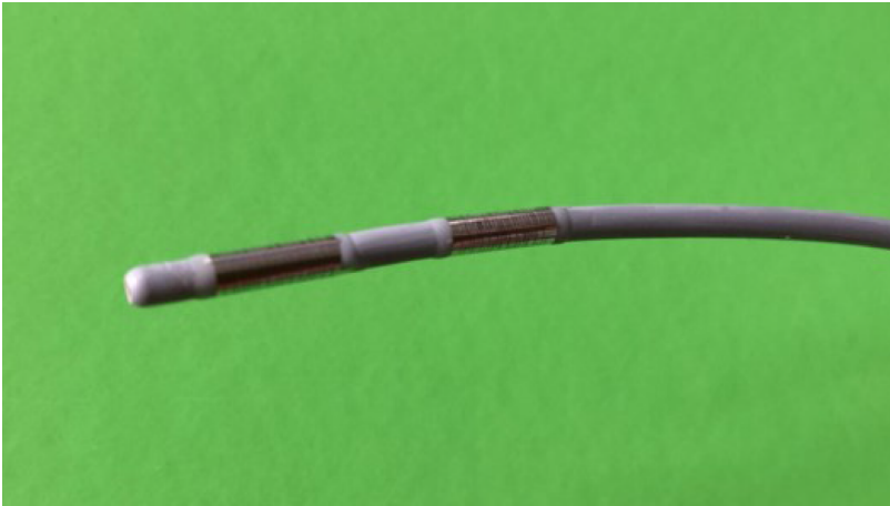
Figure 1 The Habib™ EndoHPB bipolar radiofrequency catheter (Boston scientific).

tumors, which could be the target of chemoembolizations, have a naturally better prognosis than hypovascular ones.