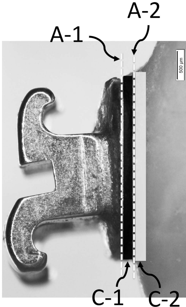
Figure 1. Diagram showing failure mode identification. Adhesive failures: Type A-1, bracket/adhesive, type A-2, adhesive/enamel. Cohesive failures: type C-1, within the adhesive layer; type C-2, within enamel. Mixed mode failures: a combination of adhesive and cohesive failures.

failure mode as diagrammatically shown in Figure 1. The modes of failure were categorized as adhesive failure (type A-1, between bracket and adhesive; type A-2, between adhesive and enamel), cohesive failure (type C-1, within the adhesive layer; type C-2, within enamel), or mixed-mode failures (a combination of adhesive and cohesive failures). The failure modes of expired and unexpired metal and ceramic brackets were compared using a chi-square test.