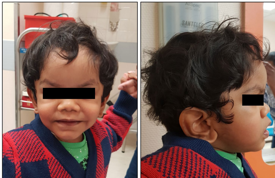
FIGURE 1 Photographs of the face and profile of patient 2 at 3 years of age demonstrating facial dysmorphism including low-set ears, prominent forehead, retrognathia, hypertelorism, anteverted nares, scaphocephaly, and horizontal palpebral fissures