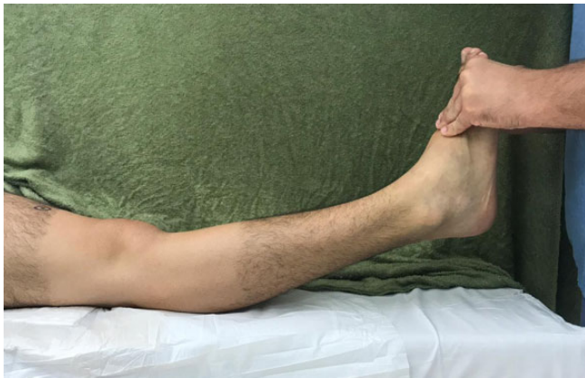
Figure 1. Knee showing passive hyperextension, observed with the patient under anesthesia.

range of motion goal was to return the knee to the same contralateral range of motion, including the hyperextension degree. Full return to sports activities was not allowed until at least 8 months and only if the patient was evaluated with good muscular control.