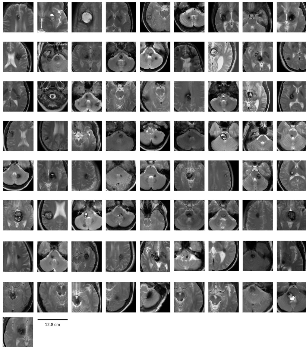
Figure 2. Magnetic resonance image thumbnails of 73 cases enrolled in CASH TR Project. T2 images of CASH lesion in 73 consecutively enrolled FUBV cases through May 2020. Images obtained at enrollment, cropped to the region highlighting the CASH lesion at similar scale (bar = 12.8 cm). A diagnostic CASH event must have occurred within the prior 12 months (images of diagnostic hemorrhage not shown).